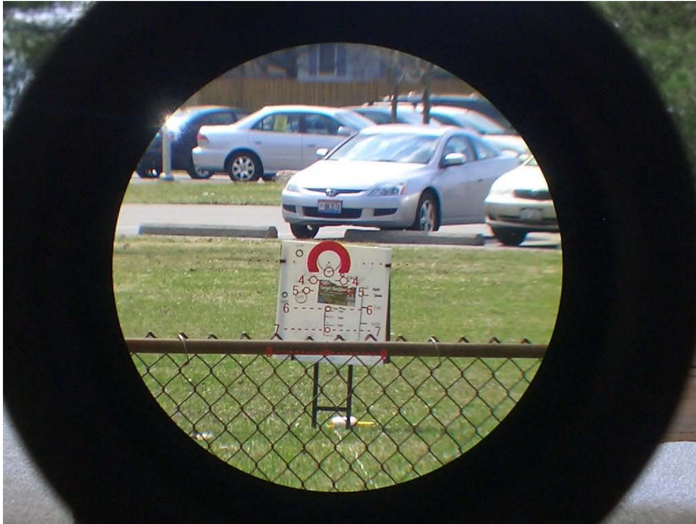
The view through the GRSC J scope at 1x with maximum illumination. Not how the big thick horseshoe you saw at 6x is now essentially a dot with all finer scope elements unnoticeable. This is the goal of Ed's reticle. To essentially dial down to a red dot scope at 1x.